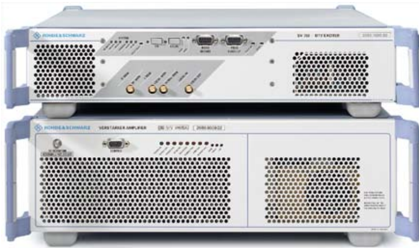
120 W Transmitter R&S® SV 7002 (standalone solution)