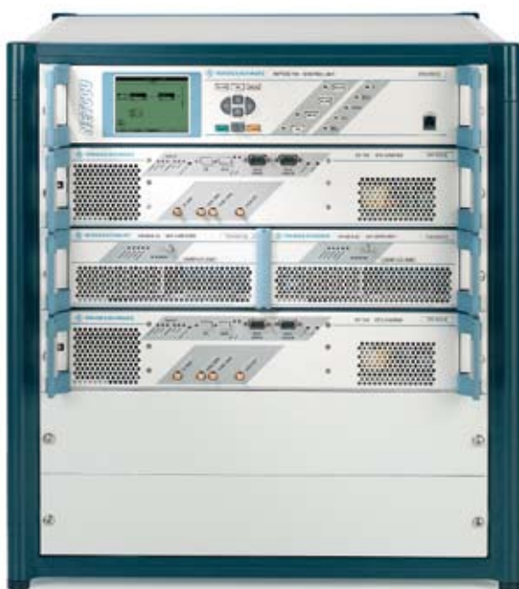
12.5 W DVB-T/-H Transmitter R&S®SV 7002 with passive exciter/power amplifier and R&S®NetCCU® 700

For use as a retransmitter, the R&S®NetCCU® 700 is enhanced by a professional DVB-T/-H receiver as the frontend that demodulates the off-air signal and provides an error-corrected ASI signal.